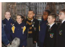
Children help Bash Street Kids celebrate special anniversary! See page 15