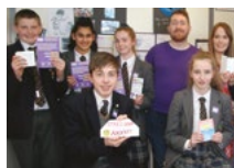
Pupils embrace Mental Health project See page 6

Identical poppies were sold by the High School in order to raise money for Poppy Scotland, and the School was thrilled when,