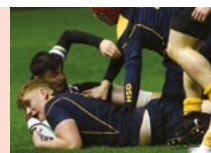
School reaches U16 Scottish Cup Rugby Final for first time See page 24